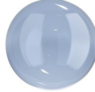
Smoke - SMK