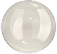
Transparent - TRA