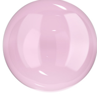
Ruby - RUB